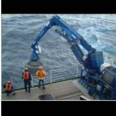
Fig 3.CTD Rosette.

Measurement of temperature, salinity, oxygen profiles(RMS) water sampling and analysis of salinity , Oxygen, nutrients CFC11, 12, 113,, total alkalinity, DIC,TOC,and pH.