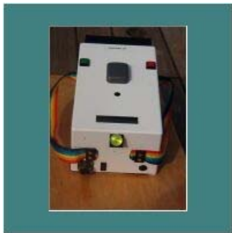
Fig 5.SIMBAD Radiometer.

Storing: The files are in JAMSTEC folder/leg6.