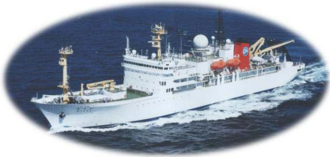
Fig1.The Research Vessel Mirai.

range of 12,000 nautical miles and is therefore capable of year-around use in high latitude seas.