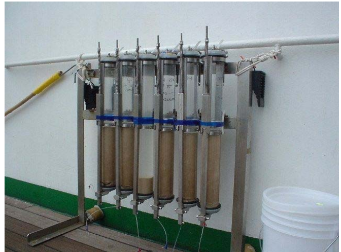
Fig 6 Piston core & Gravity core. Fig.7 Sediment Sample.